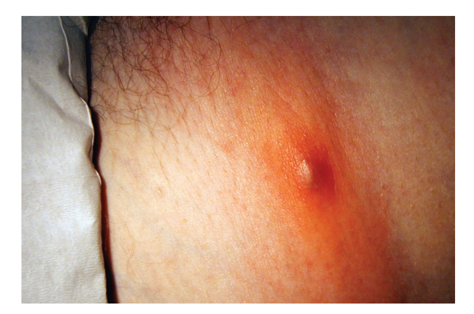
Figure 3. CA-MRSA lesion of patient J. Location: left groin.

pustules with a central hard white core, similar to furunculosis. Several patients stated that selfremoval of this core resulted in clearing of their infection.