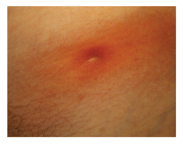
Figure 1. CA-MRSA lesion of patient J. Location: left groin.